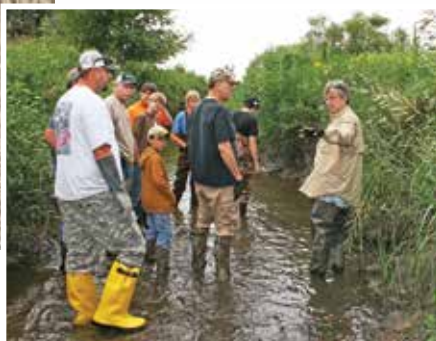
Wetland habitat trap sets explained during a fur harvester education course.

Geese sometimes use muskrat huts for nesting in spring and rest during fall migration.